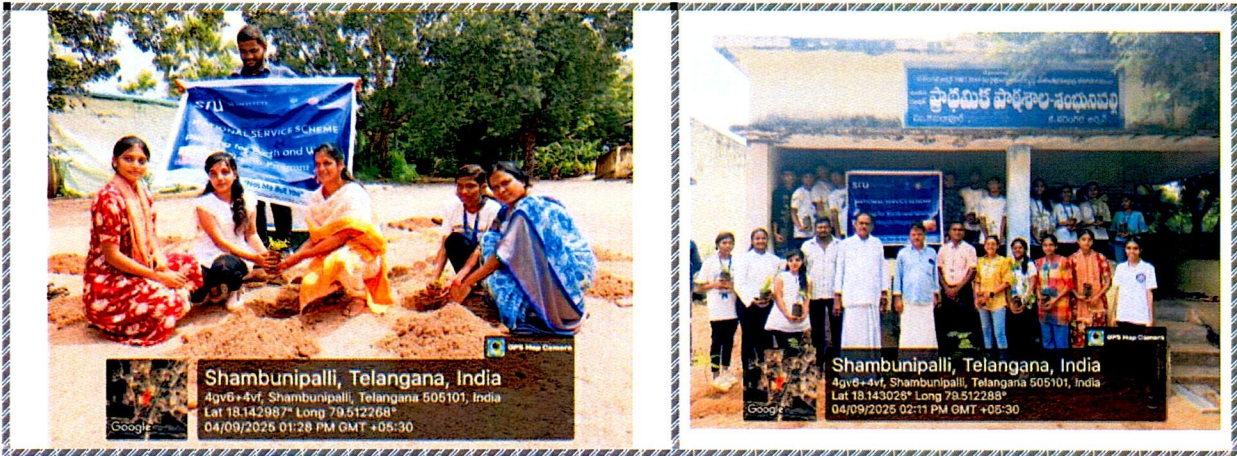
Shambunipalli, Telangana, India 4gv6+4vf, Shambunipalli, Telangana 505101, India Lat 18.142987° Long 79.512268° 04/09/2025 01:28 PM GMT +05:30 Shambunipalli, Telangana, India 4gv6+4vf, Shambunipalli, Telangana 505101, India Lat 18.143028° Long 79.512288° 04/09/2025 02:11 PM GMT +05:30 Caption: "Empowering Women, Protecting Nature—One Plant at a Time."